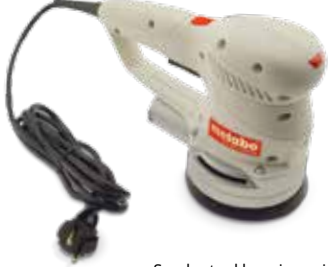
Sander tool housing printed in DuraForm PA material

The sPro SLS systems share a common architecture to produce high-resolution, durable thermoplastic parts available in medium to large build volumes.