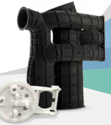
Electronic component printed in DuraForm ProX PA

Complex ducting for optimized air flow printed in DuraForm EX Black